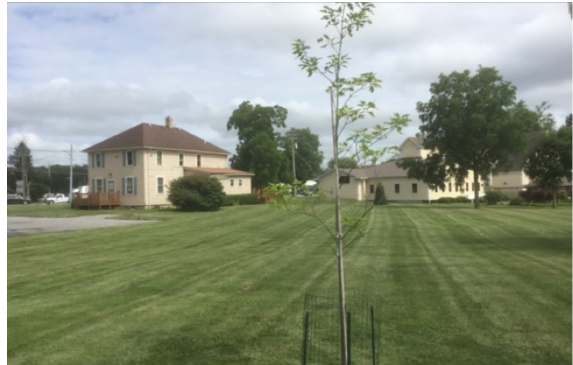
View of Town of Rush "Campus" from vantage point of oak tree planted by Rush RPA