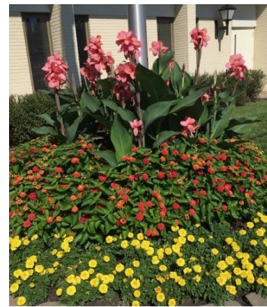
Town Hall Garden