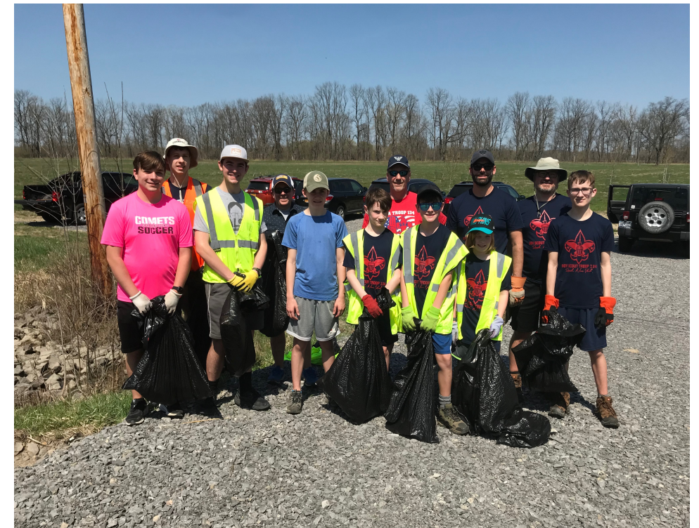
Girl Scouts (above right) and Boy Scouts helped with Clean-Up.