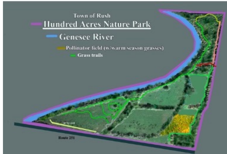
Hundred Acres Nature Park