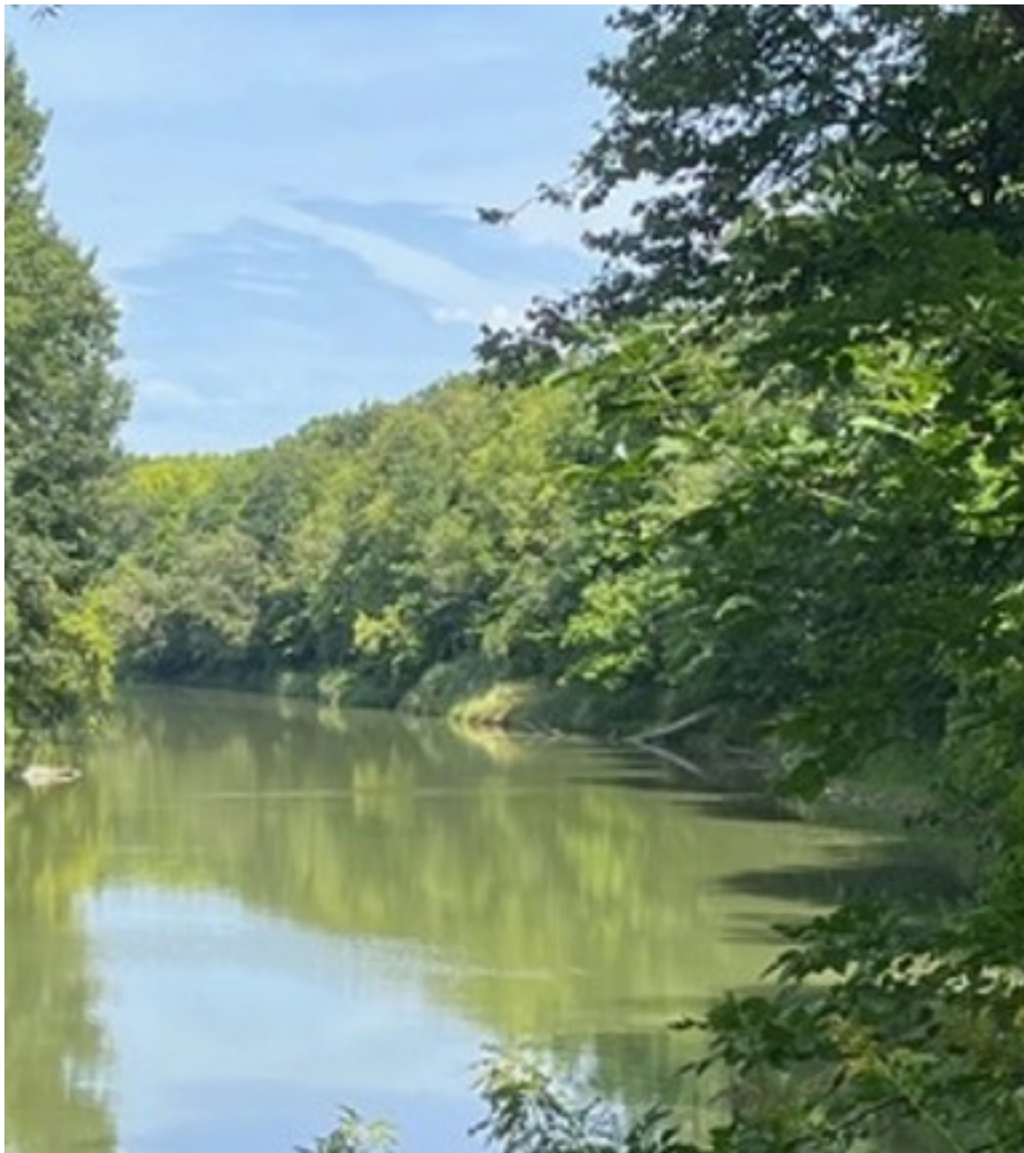
River Overlook at Hundred Acres Nature Park