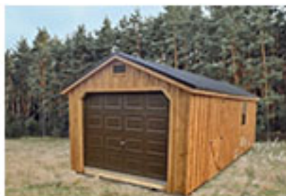
shed with stone foundation